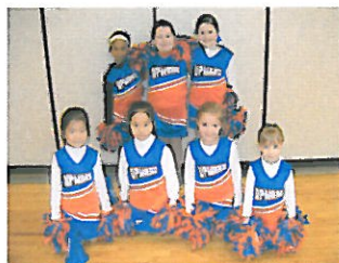
"Upward Basketball/ Cheerleading... Where every child is a WINNER!"

OUR UPWARD BASKETBALL SEASON IS IN FULL SWING!